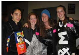
Only Fools Run at Midnight!