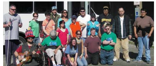
Haines Fair Music & Fun.