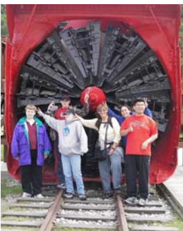
We traveled to Skagway and rode the White Pass Railway.