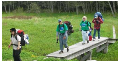
Hiking to Blue Mussel Cabin at Point Bridget.