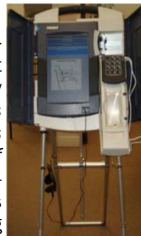
Accessible voting unit — see Page 2

Many people with disabilities have not had equal access to voting. The polling place in my voting precinct has a step that prevented people who use mobility devices from getting in the door. The Help Americans Vote Act (HAVA) passed in 2002 and the Americans with Disabilities Act (ADA) require that these types of barriers be removed. I called the State of Alaska Division of Elections in August to talk to them about this problem and was told that the state surveyed polling places around Alaska last year to find ones that had problems with accessibility.